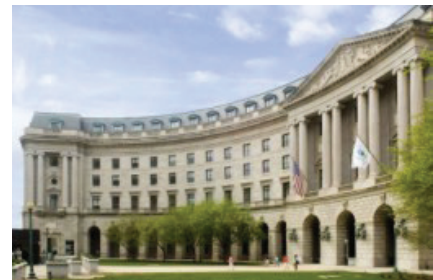
William Jefferson Clinton Building