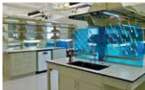
NIH - Stem Cell Laboratory