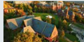
Cornell University Dormitory