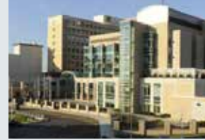
VAMC Pittsburgh, University Drive