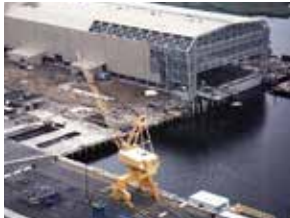
TRIDENT Refit Facility