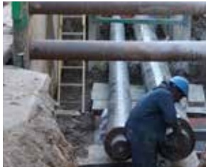
GSA HOTD Steam Line Replacement